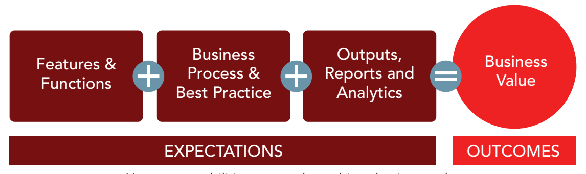
How our capabilities are used to achieve business value

As you begin to explore the capabilities within your solution, remember that you don't have to use all of them right away – our framework is deliberately modular, so that you can continuously build and improve upon your solution. Each capability contains a selection of business processes, best practices, analytics, and other resources to guide you towards achieving value in the form of specific business outcomes.