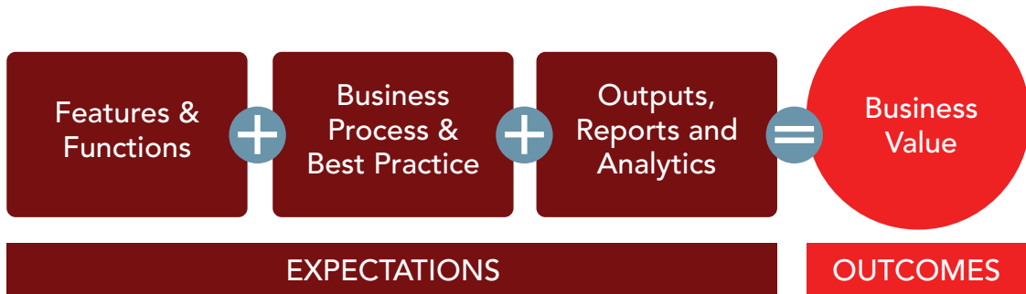
How our capabilities are used to achieve business value

As you begin to explore the capabilities within your solution, remember that you don't have to use all of them right away – our framework is deliberately modular, so that you can continuously build and improve upon your solution. Each capability contains a selection of business processes, best practices, analytics, and other resources to guide you towards achieving value in the form of specific business outcomes.